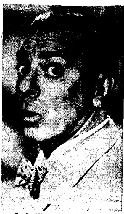
As the World Remembers Him

As a ragged kid on Hester St. he learned early how to do impersonations of popular stage stars and thus get a few pennies that might be tossed by pas-